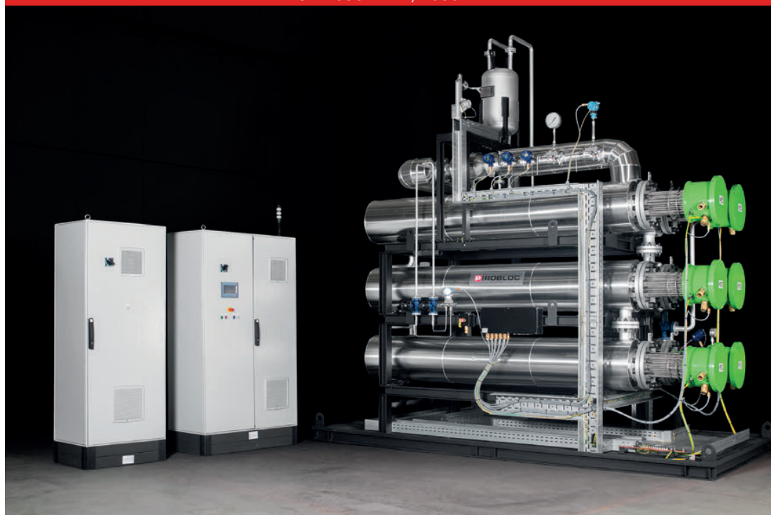
CE-1600 ATEX, 1600 kW

The power control is completely automatic and it is guaranteed simply by selecting the desired temperature on the control panel. In the control panel are placed contactors or solid state relays that will activate the different stages of the resistance.